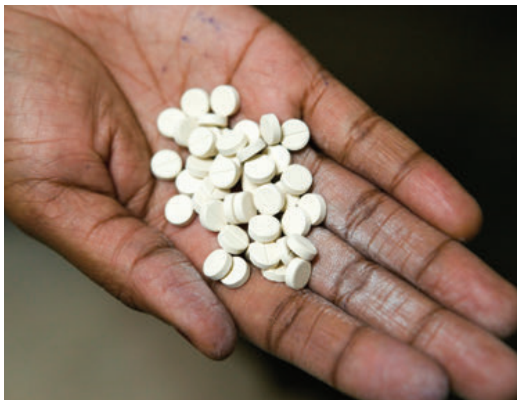
A handful of AIDS pills, Pepo La Tumaini Jangwani HIV/AIDS Community Rehabilitation Program, Orphanage & Clinic, Isiolo, Kenya.

far less infectious. The World Health Organization (WHO, 2015) is currently using this as one argument for treating people long before it is necessary to avoid death. However, this extension to treatment-as-prevention would be a further massive fiscal commitment, and in terms of the prevention objective other means of reducing the spread may be more cost-effective.